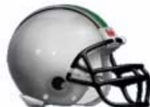
Greensboro College Pride