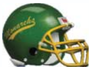
Methodist University Monarchs