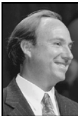
Sen. Paul S. Tribble, Jr. Christopher Newport