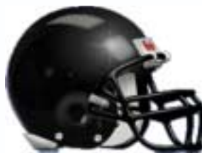
Ferrum College Panthers